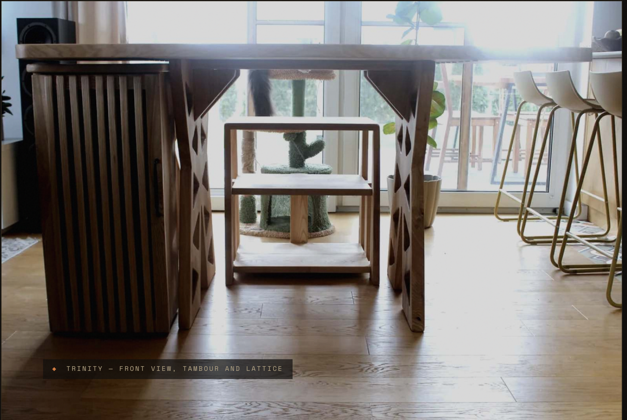
◆ TRINITY – FRONT VIEW, TAMBOUR AND LATTICE