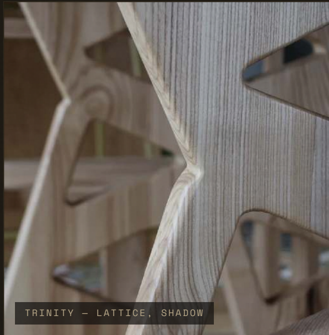
TRINITY - LATTICE, SHADOW