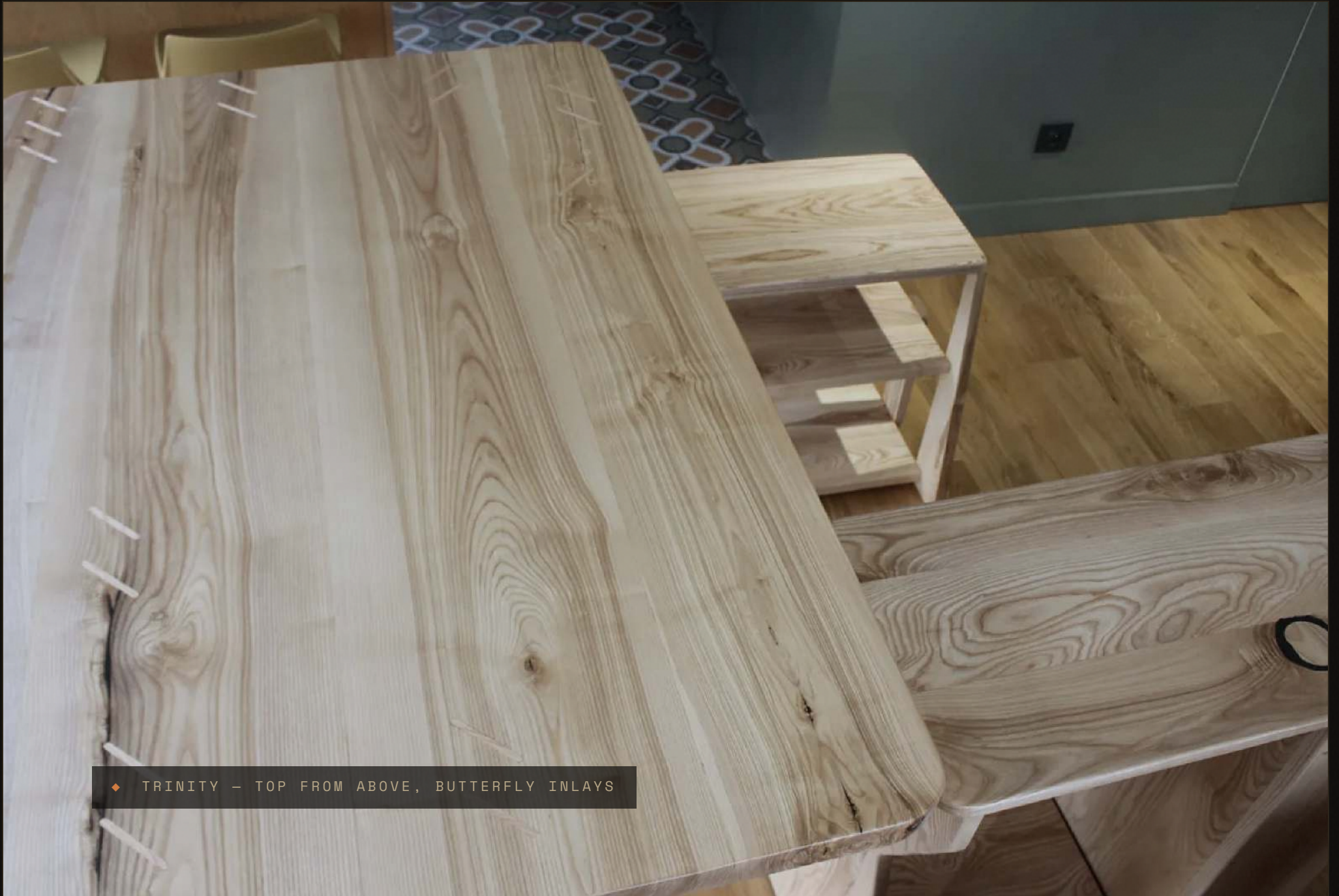
◆ TRINITY – TOP FROM ABOVE, BUTTERFLY INLAYS