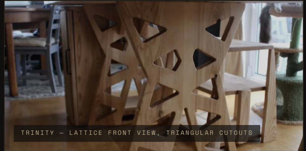
TRINITY – LATTICE FRONT VIEW, TRIANGULAR CUTOUTS

A knot in the side table fell out. I wanted to leave the hole. The client didn't. I covered it with an ash dowel, black fill on the sides. It came out like an eclipse.