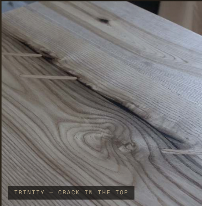
TRINITY - CRACK IN THE TOP