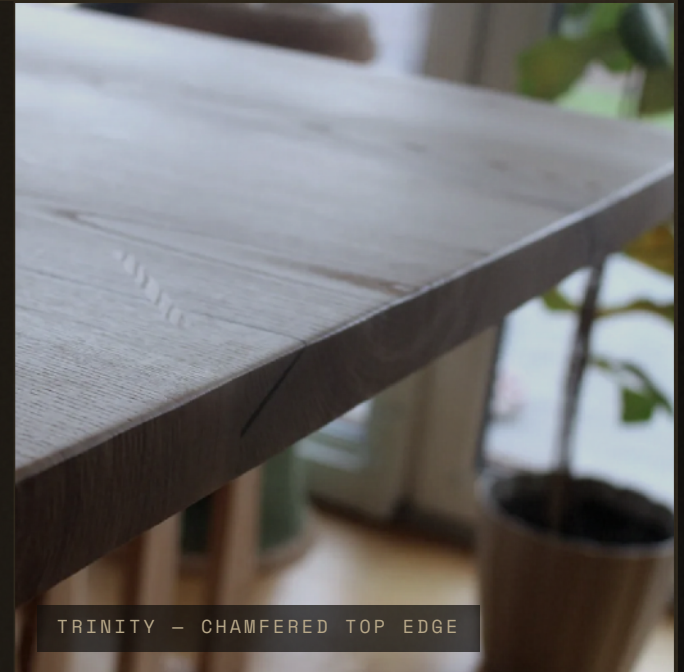
TRINITY - CHAMFERED TOP EDGE