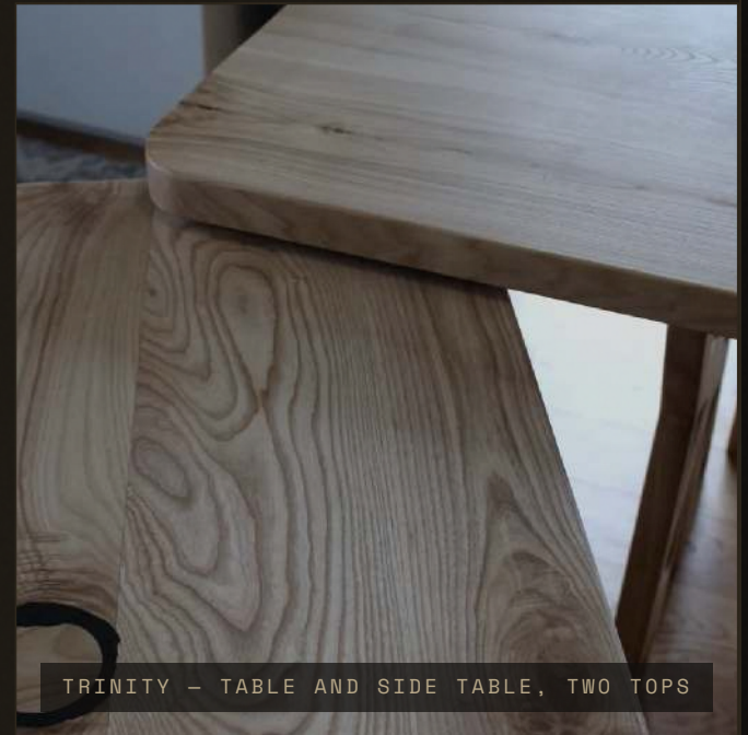
TRINITY - TABLE AND SIDE TABLE, TWO TOPS