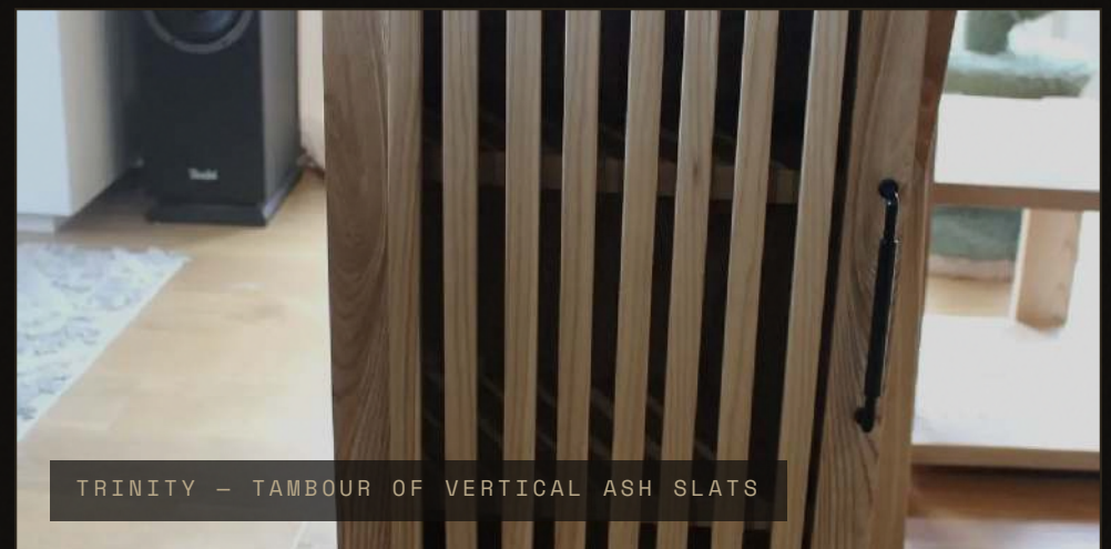
TRINITY – TAMBOUR OF VERTICAL ASH SLATS