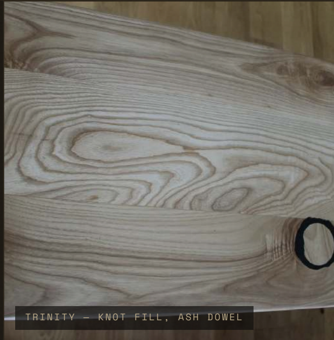
TRINITY - KNOT FILL, ASH DOWEL